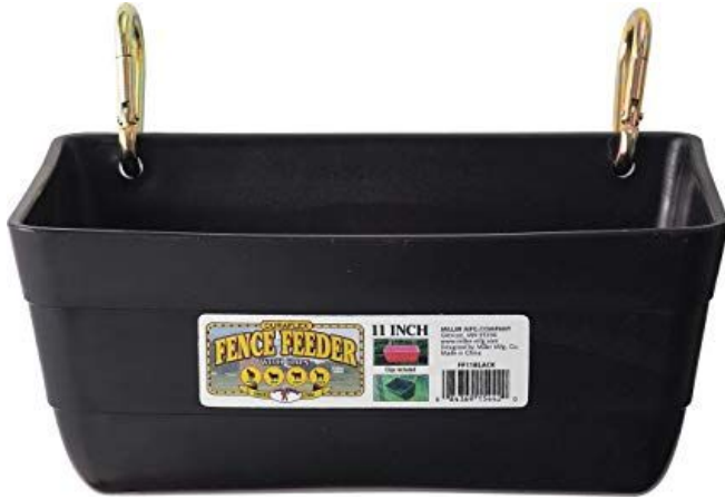
Hang on Feeder