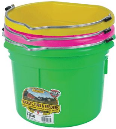
2 gallon water bucket