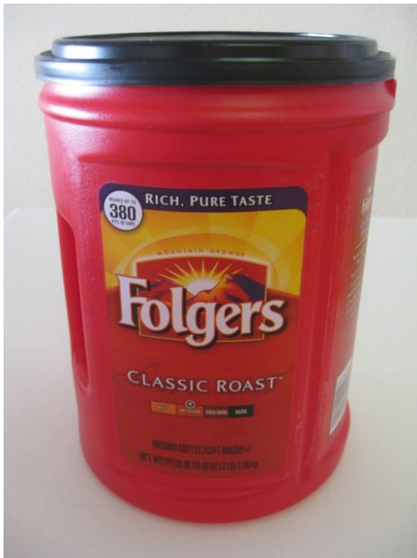
One pound coffee can to measure feed