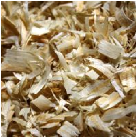
Large flake pine shavings